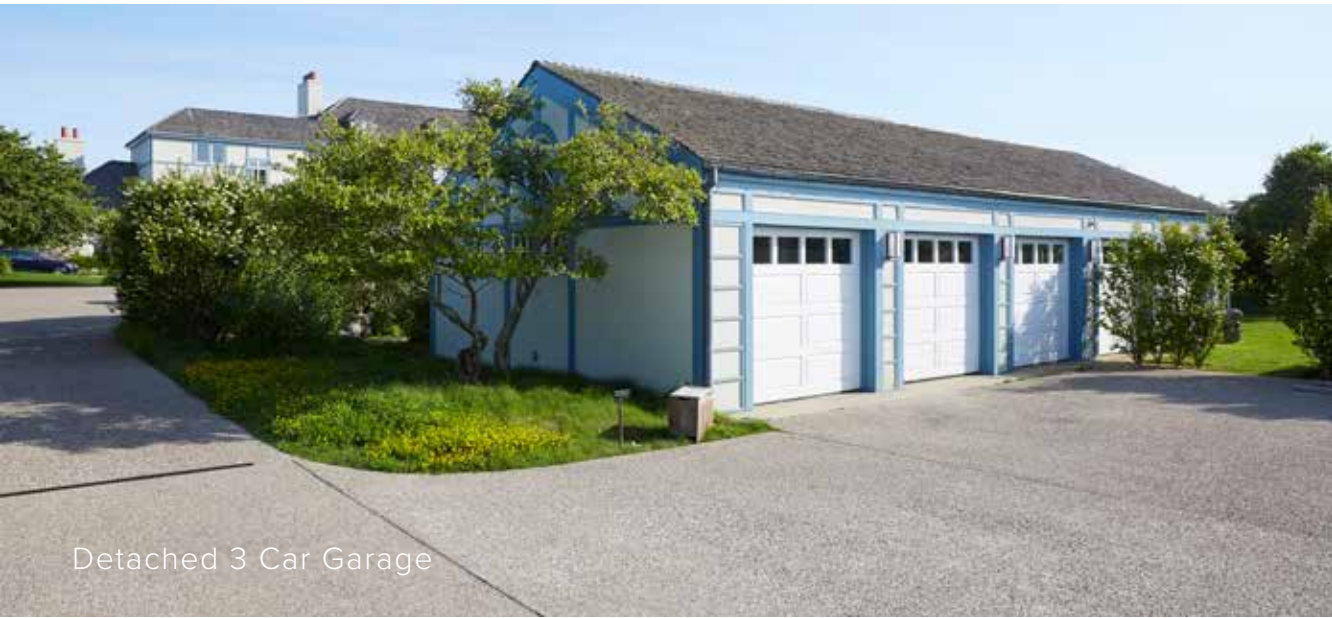
Detached 3 Car Garage