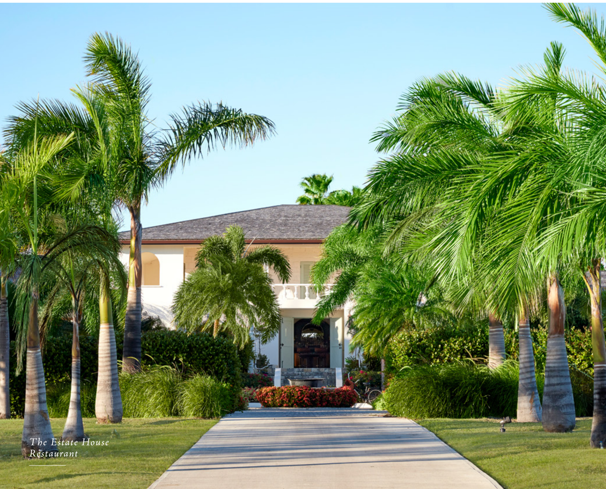
The Estate House Restaurant