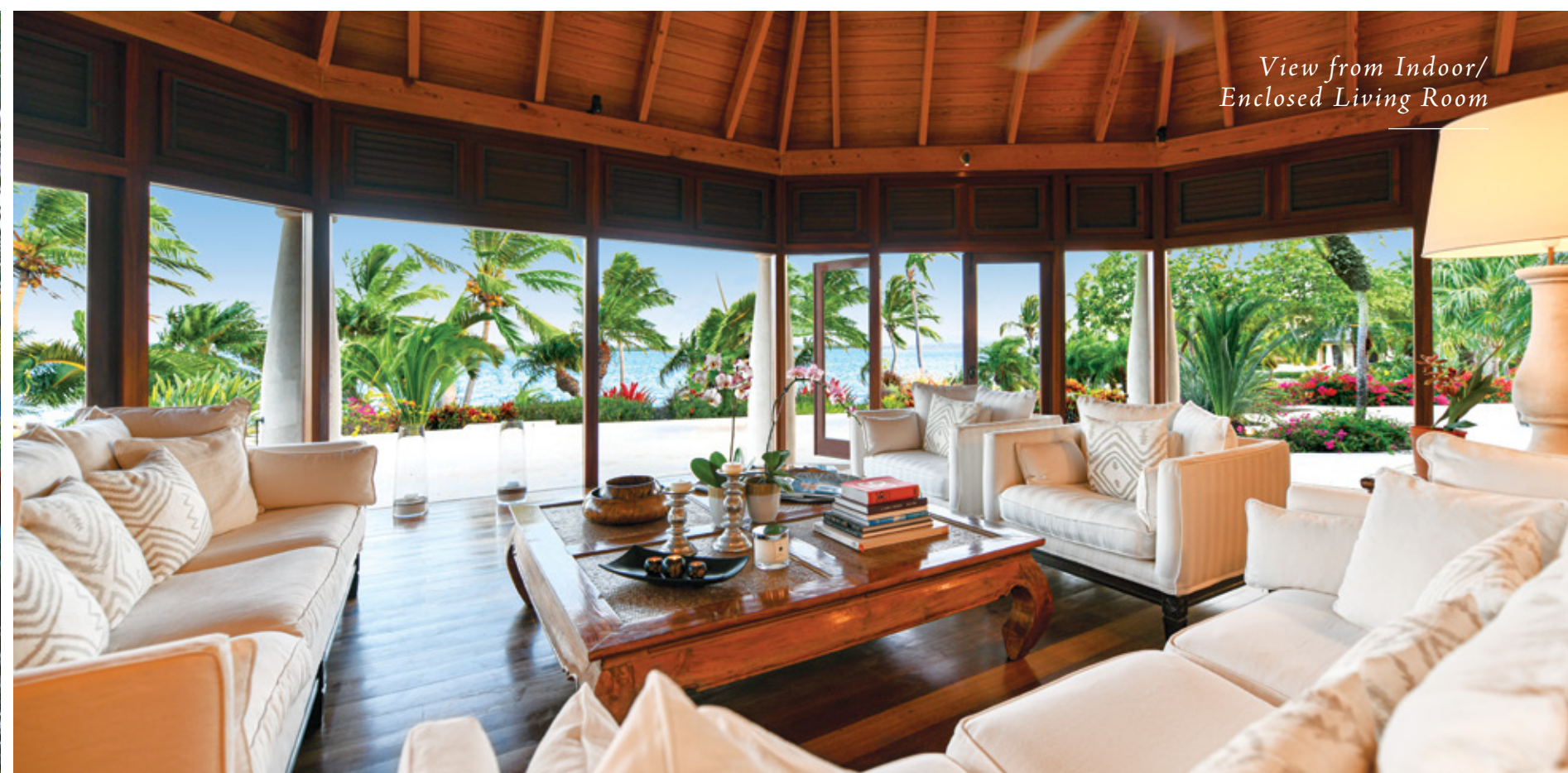
View from Indoor/ Enclosed Living Room