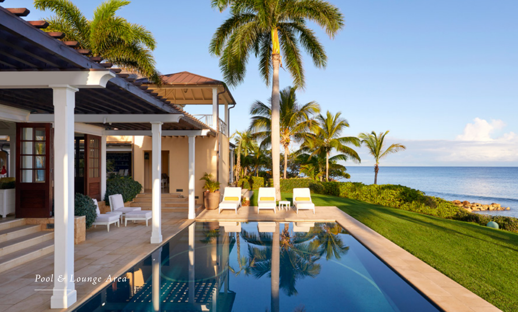
Pool & Lounge Area