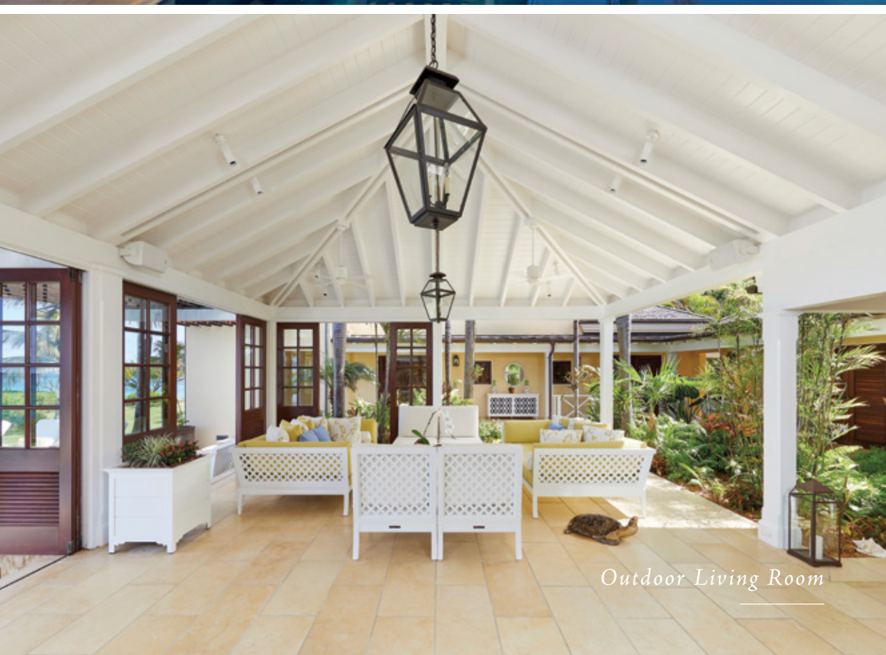
Outdoor Living Room