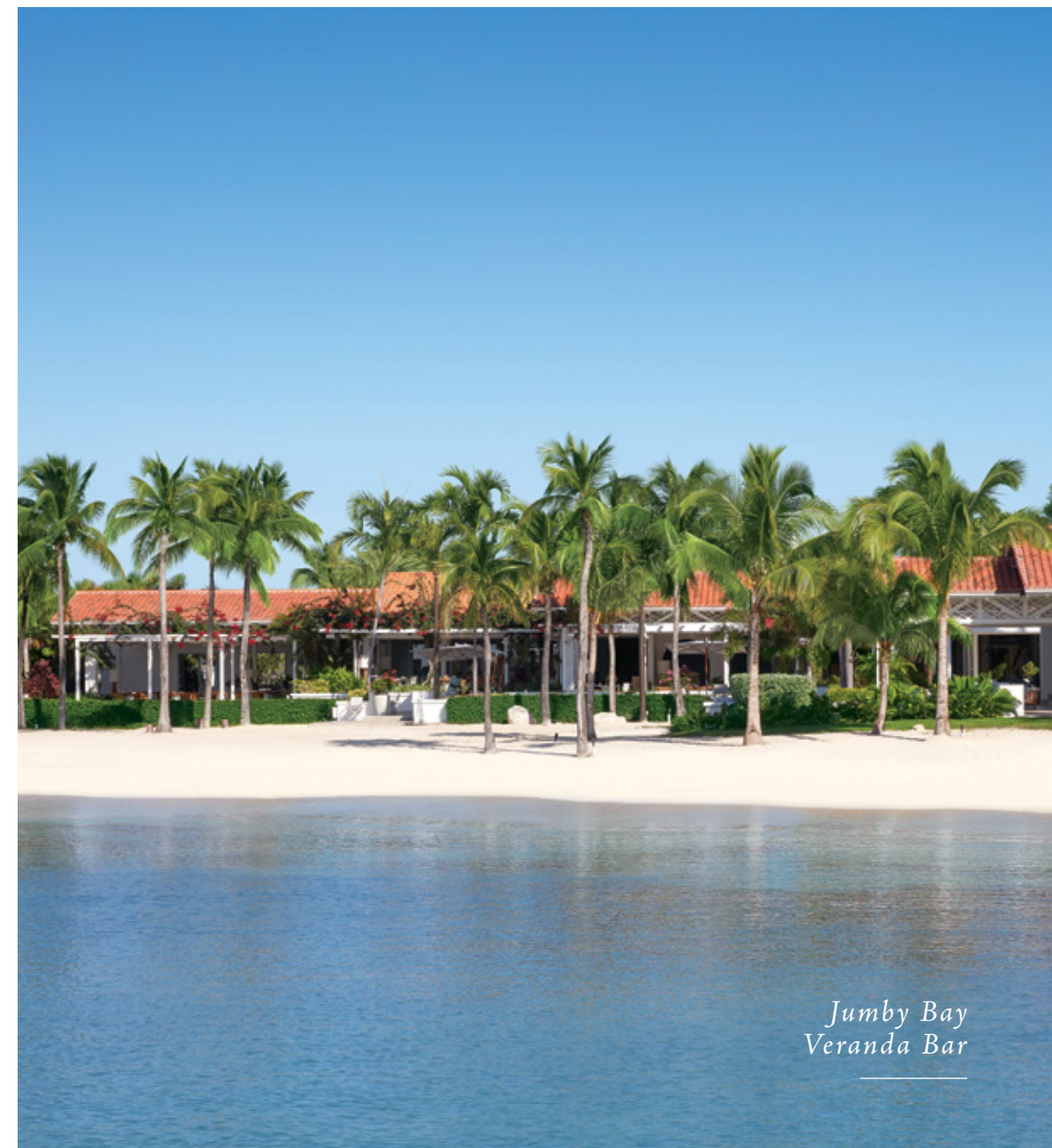
Jumby Bay Veranda Bar

Homeowners can also choose to experience the charm and flavour of the hotel’s restaurants and bars, enjoying a 50% discount on food and beverages within the resort. Or dive into Antiguan life! Ask the concierge to arrange lunch or dinner at one of the many great restaurants on the mainland.