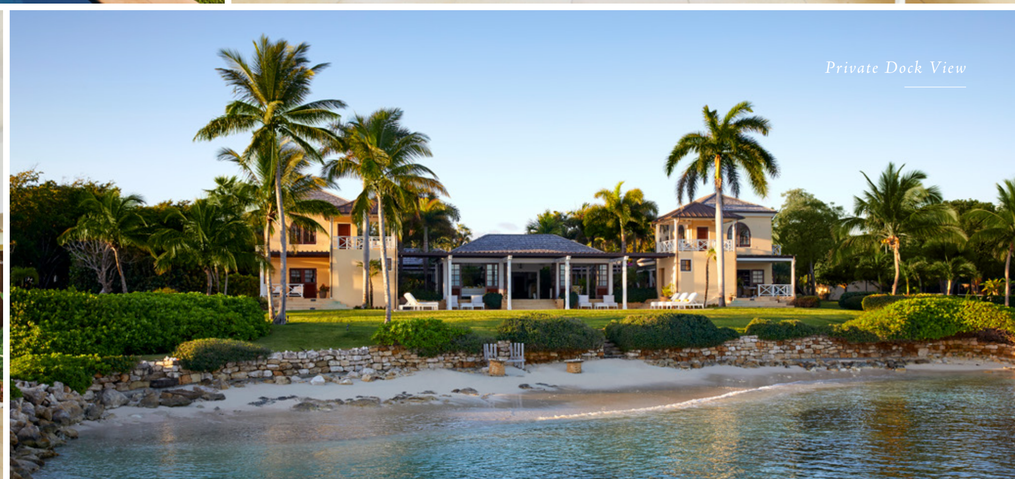
Private Dock View